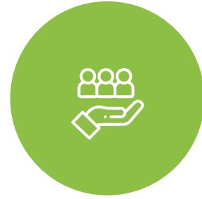
Human Resources HR MANAGERS