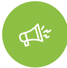
Marketing Team MARKETING SPECIALISTS